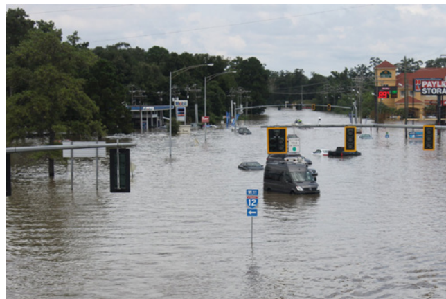
Flooded businesses in Baton Rouge, LA, August, 2016.

FLASH has been developed by researchers from the NOAA National Severe Storms Laboratory and the University of Oklahoma/NOAA Cooperative Institute for Mesoscale Meteorological Studies in Norman, Oklahoma. This research is described in a paper accepted for publication entitled, "The Flooded Locations and Simulated Hydrographs (FLASH) project: Improving the tools for flash flood monitoring and prediction across the United States."