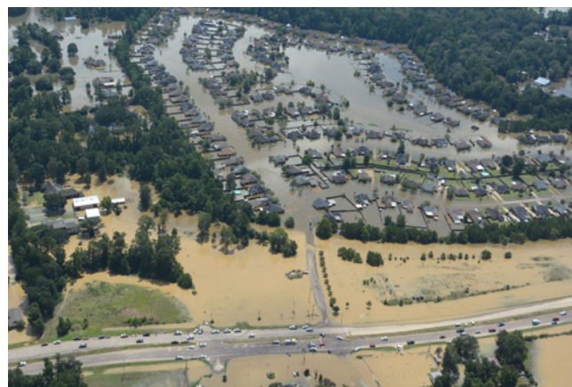
Aerial image showing flooding in Louisiana, August 14, 2016.