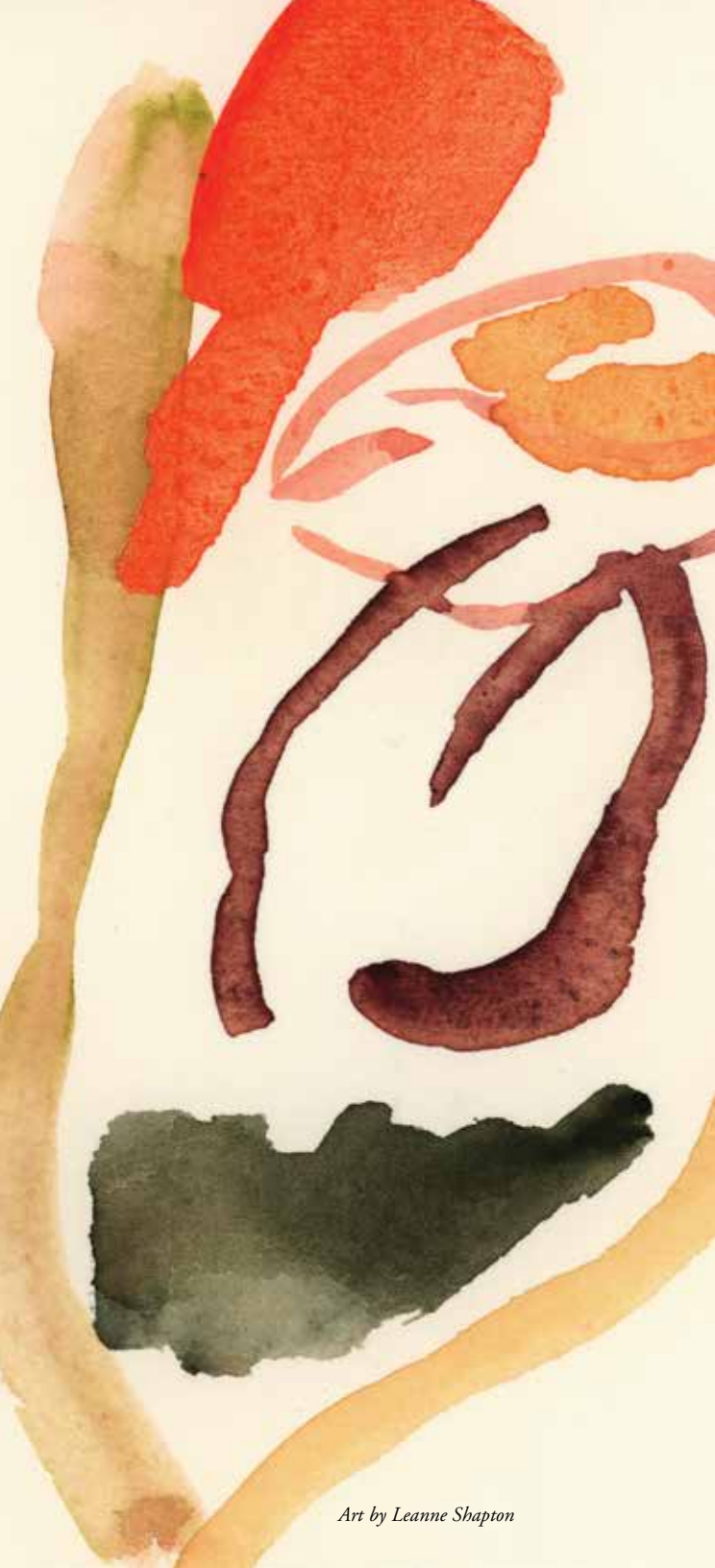
Art by Leanne Shapton