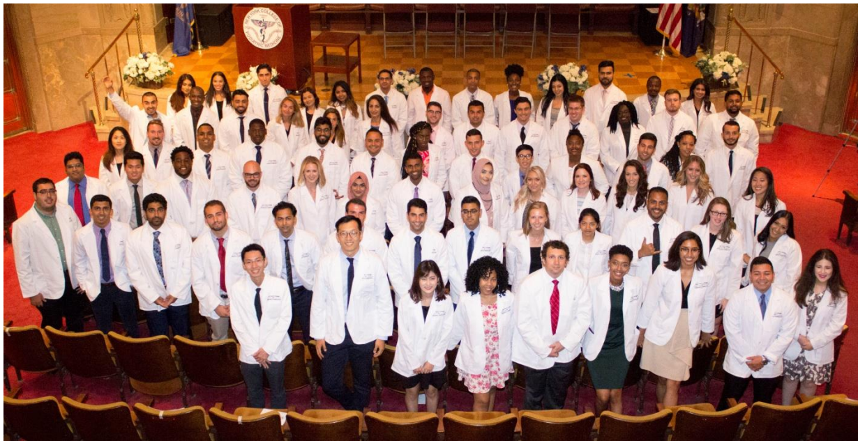
The annual White Coat Ceremony symbolizes lifelong commitment to serving the health care needs of patients.