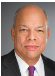
Former U.S. Secretary for the Department of Homeland Security Jeh Johnson.

business, your workforce and your customers. The people who work for you and who depend upon your advice are relying on your leadership to respond in ways that protect them, and that will ensure the resilience of your business.