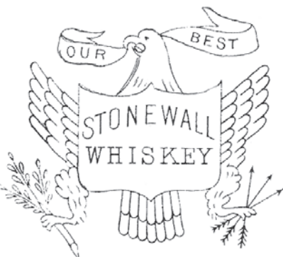
Figure 8: Stonewall Jackson whiskey ad

After the Civil War, both Southern and Northern generals were honored with their names on whiskey bottles. For example, General Stonewall Jackson, a Confederate leader killed in battle, had two whiskeys named for him. One, as shown in an ad here, [Figure 8] was "General Stonewall," a product of the B.B. Davies Company of New York City. "Stonewall Jackson" whiskey by contrast