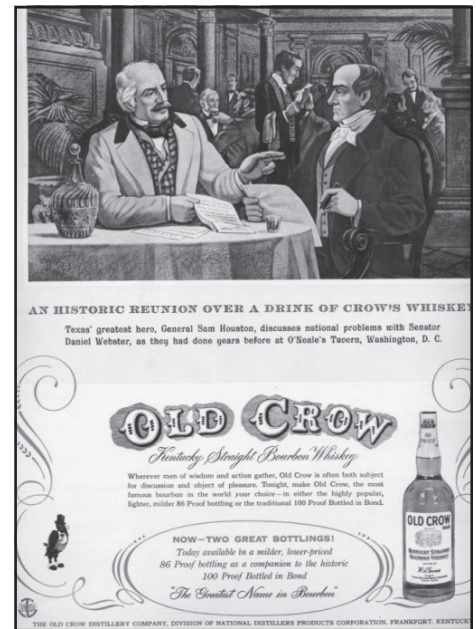
Figure 2: 1955 Old Crow Ad: Houston & Webster

Old Crow has always trumpeted its historical connections including depicting important figures as customers. The ad shown here [Figure 2] purports to show Texas hero Sam Houston sharing its bourbon with famous orator Daniel Webster.