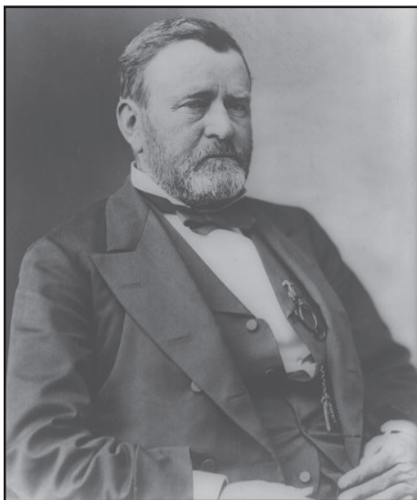
Figure 1: Ulysses S. Grant as President