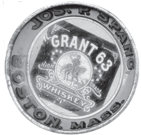
Figure 10: Grant 63 tip tray

with a bottle of the whiskey on a tray with two shot glasses and praises the product as "The Perfect Whiskey."