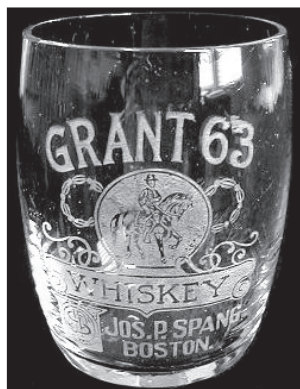
Figure 9: Grant 63 shot glass

The label on the bottle and items such as Spang's give-away shot glasses featured Grant, one of the best horsemen America ever produced, astride a prancing steed [Figure 9] There are loops of braided rope on either side and curlicues on the base. The glass also shows a frosted shield that holds a JPS monogram — representing Joseph P. Spang. A Spang tip tray [Figure