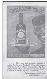
Figure 11: Grant 63 ink blotter

with a bottle of the whiskey on a tray with two shot glasses and praises the product as "The Perfect Whiskey."