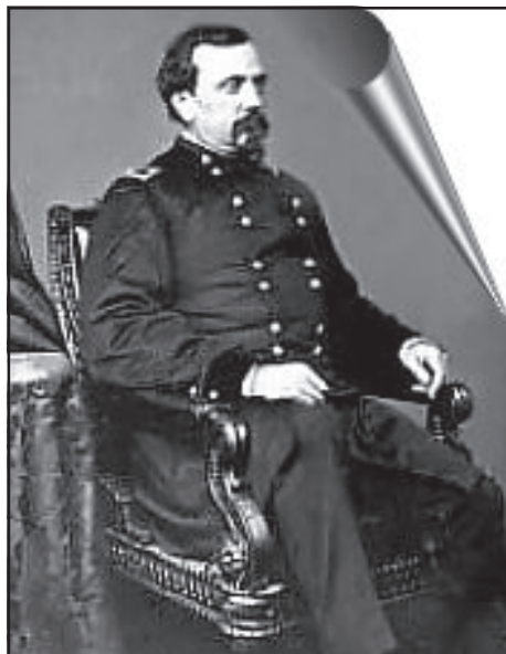
Figure 5: General Orville Babcock Sylph." This was the name given to her by one of the conspirators, General Orville E. Babcock [Figure 5], who also happened to be a White House aide, personal secretary to President Grant.