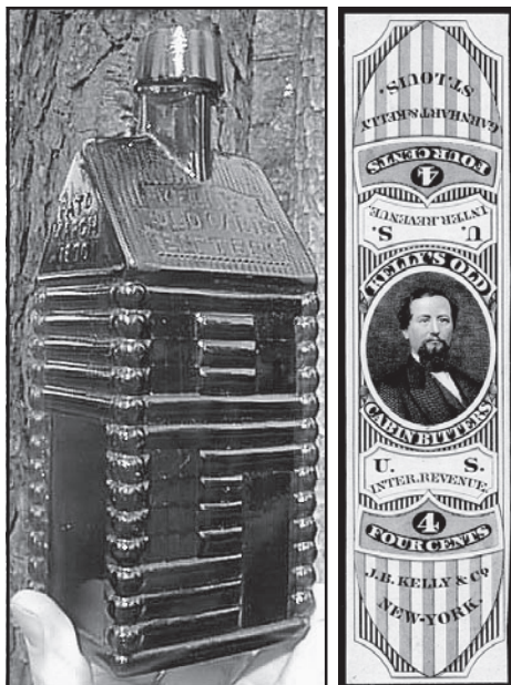
Figure 3 (L): Old Cabin Bitters Bottle Figure 4 (R): Kelly's "Proprietary" Revenue Stamp

peaked roof. It is a Kelly's Old Cabin Bitters [Figure 3]. Examples have sold to bottle collectors in recent months at prices approaching $2,000. Kelly was James B. Kelly of New York, a whiskey man, who is shown on a self-produced "proprietary" revenue stamp [Figure 4]. This is an ironic touch since it was an attempt to evade federal revenues on alcohol that lay at the heart of the Great Whiskey Ring.