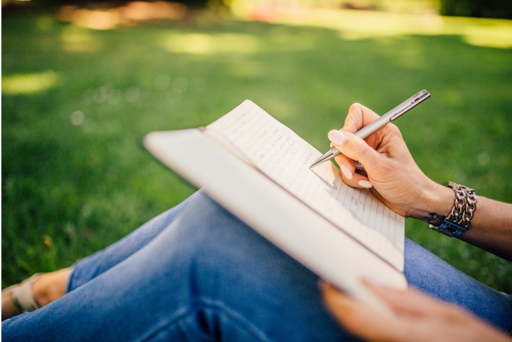
A Person Writing a Poem

Poets write many kinds of poems. Many poets write poems to express themselves. They may write poems to share their feelings about events that are important to them or memories of special times in their lives. They may write poems to tell stories or describe places, people or animals. Poems may be funny, sad, serious, scary or exciting. Each poet has a different way of writing poems. Some poets use many descriptive words, like adjectives and adverbs. Some poets use rhyming words. Words that rhyme sound similar, like tree, free and agree.