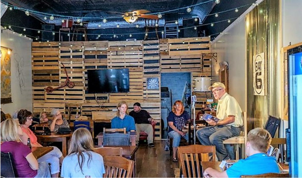
Poetry Reading in a Coffee Shop

People may enjoy reading poems alone or as a group. Many people enjoy listening to poems being read aloud. People will celebrate poems and poets during National Poetry Month in April. They may read poems by their favorite poets or share their favorite poems with friends. They may decide to memorize a poem. Some people will go to poetry readings in coffee shops and libraries. People may borrow books of poems from libraries or write their own poems. Students may learn about poems in school. You can start celebrating by reading the poem that starts on page 9!