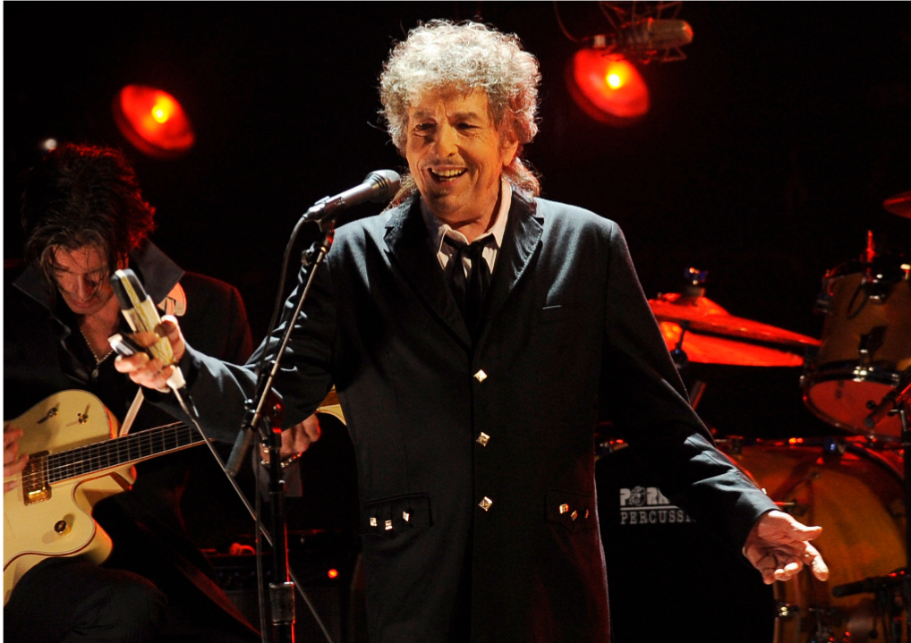
Bob Dylan Performing

Some poems are paired with music to create songs. Poems can become any kind of music, including country music, pop music, rap music, rock music and more! Songwriter and singer, Bob Dylan, received a Nobel Prize in literature for the songs he wrote. Bob Dylan received the Nobel Prize in 2016. Bob Dylan was the first songwriter to receive this award. Bob Dylan was a popular songwriter and singer in the 1960s. He still travels around the world to perform in concerts.