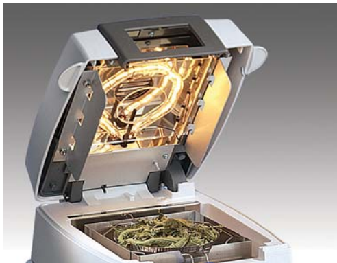
Easy sample access