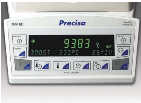
Menu-driven, screen-guided applications