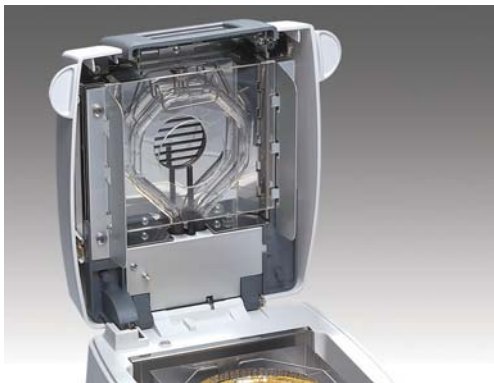
3 different radiation heat sources are optional