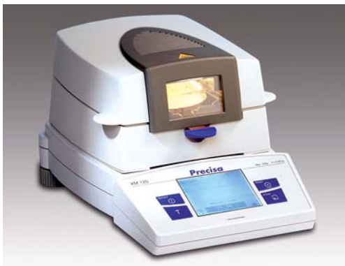
Compactly styled design