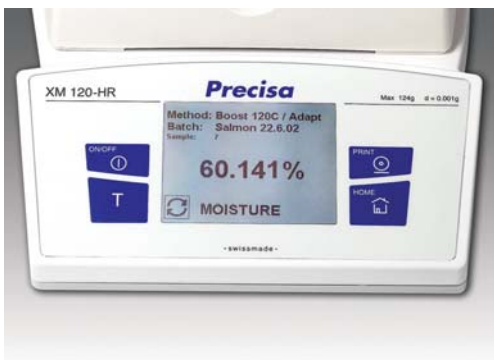
Outstanding Touch Screen Display