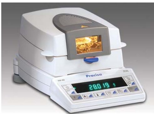
Robust and simple to operate