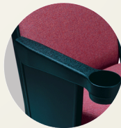
Cup Holder Armrest