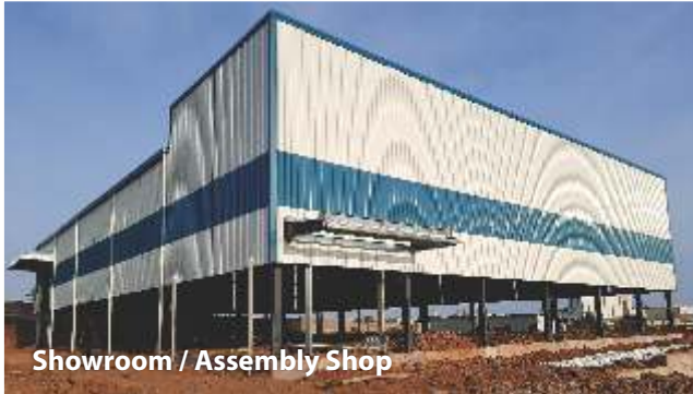
Showroom / Assembly Shop