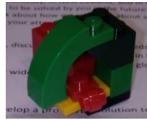
Child Abuse Reporting Toy

Year 9 students had a week with a difference, focussing on the future and the skills they need to get the most out of Year 10. One challenge which showed team work, problem solving and innovation, was the Lego Challenge. Winning designs included solutions to child abuse, starvation and the housing shortage.