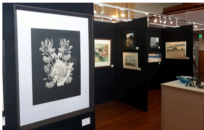
(left) Kylie Waitai, Native Birds paper cut drawings