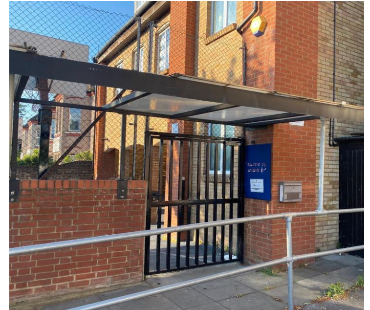
Year 7 - Year 11 Entrance