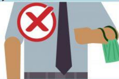
On your arm