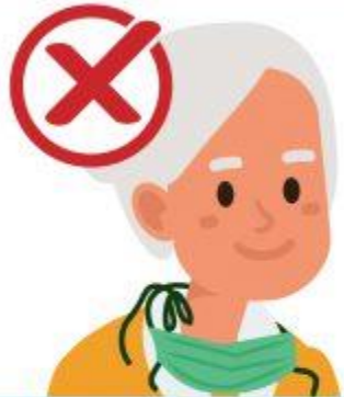
Around your neck