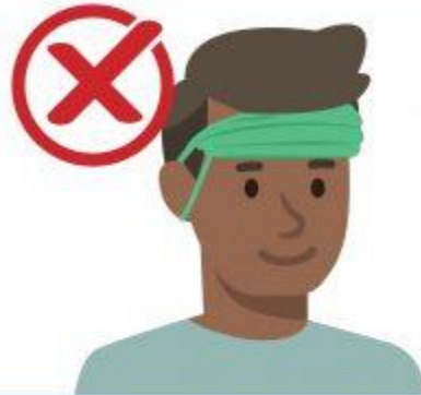
On your forehead