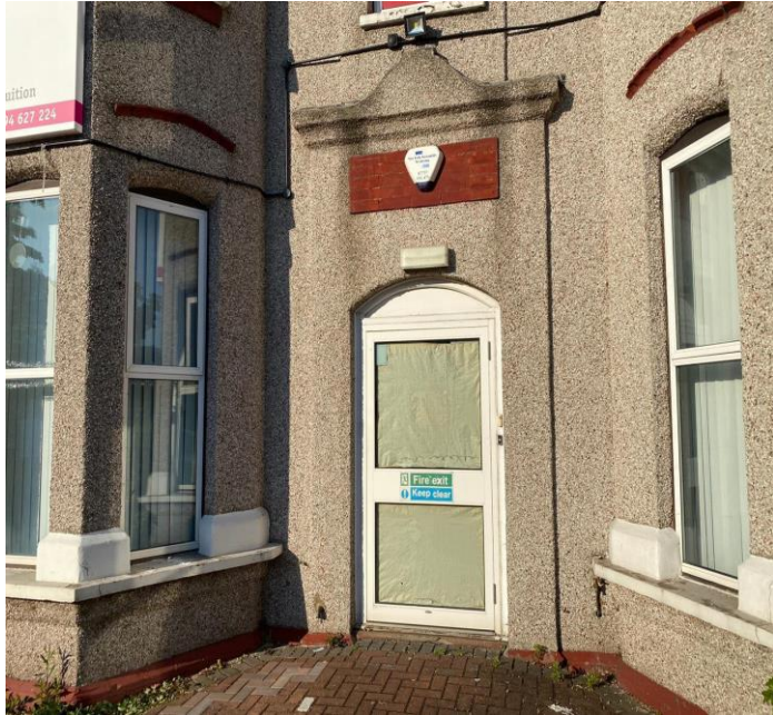
Y1, Y5, Y6 & EYFS Makkah Entrance

We will ensure social distancing is maintained and so that not all pupils enter and leave school at the same time using the same entrance and exit.