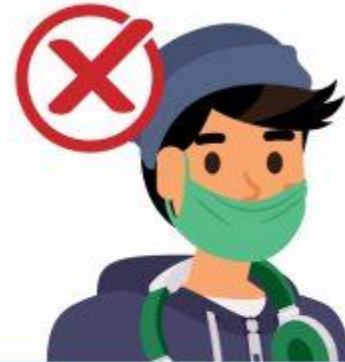
Under your nose