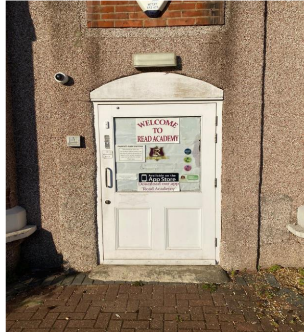
Y2, Y3, Y4 & EYFS Madinah Entrance