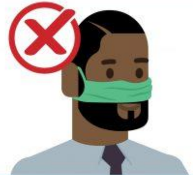
Only on your nose