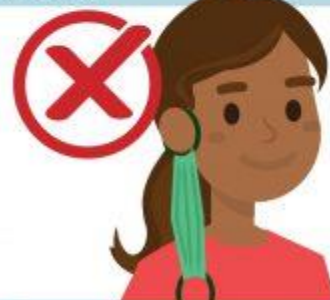
Dangling from one ear