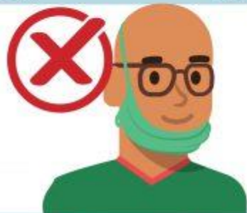
On your chin