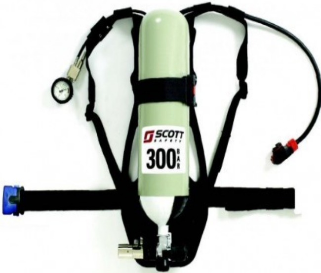
Scott Sigma 2 Type 2

Ship wheel approved BA set designed with the marine industry in mind