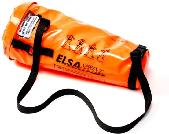
Scott Elsa Sprint 10/15-B Escape set

An escape set provides immediate breathing air and users need very little training.