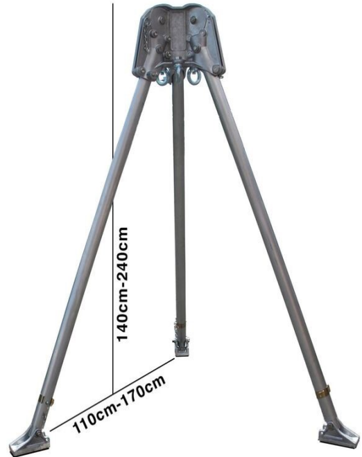
TO3 Two Person Tripod