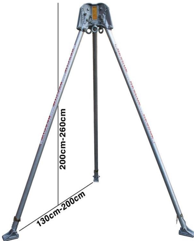
RT3 Two Person Rescue Tripod