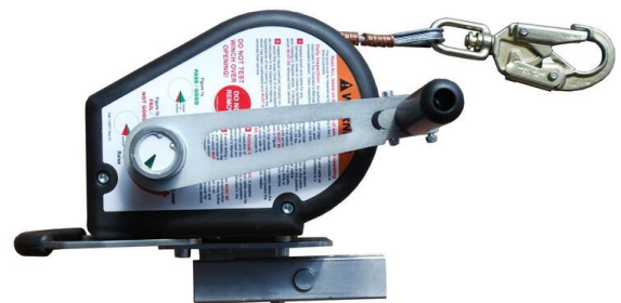
60005 Tuff 30m Man Riding Winch