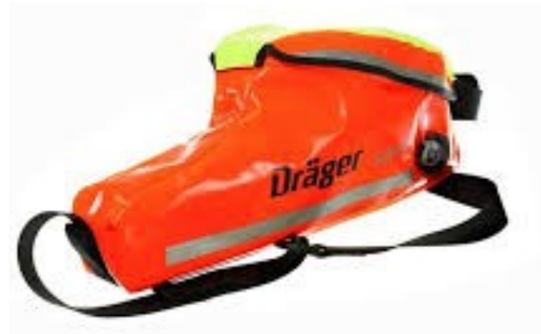
Dräger PP10/15 Escape set