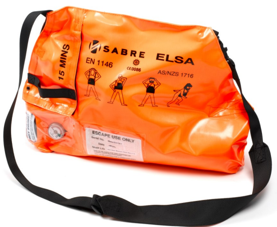
Scott Elsa 10/15-B Escape set