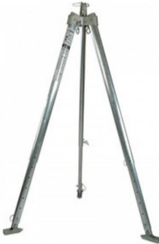
RGR1 Rescue Tripod