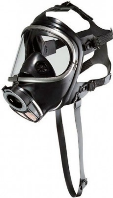
Drager Panorama Nova face mask