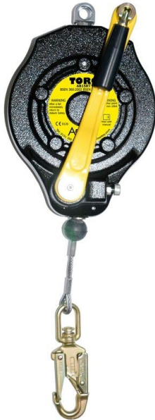
AB15RT 15m Fall Arrest with Recovery