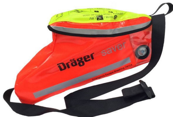
Dräger CF 10/15 Escape set