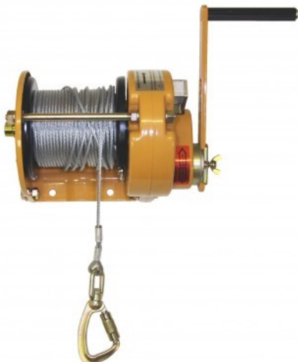
RGR7 Rescue Winch 50m