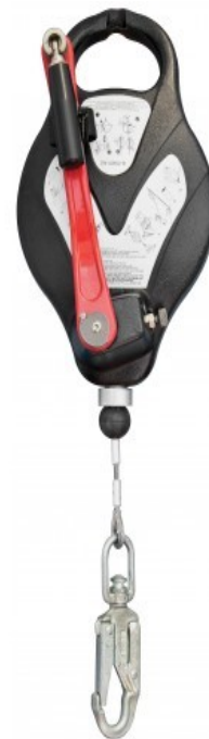
RGA4 15m Fall Arrest with Recovery