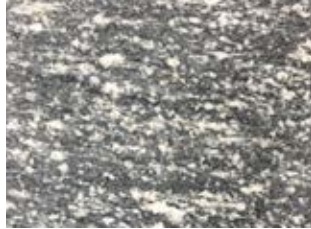
FLAMED min thickness - 0.75" / 20 mm