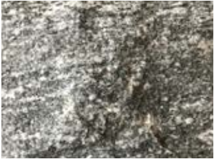
SPLIT min thickness - 3" / 75 mm