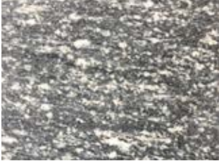
HONED min thickness - 0.75" / 20 mm