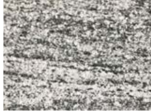
BUSH HAMMER min thickness - 1.5" / 38 mm