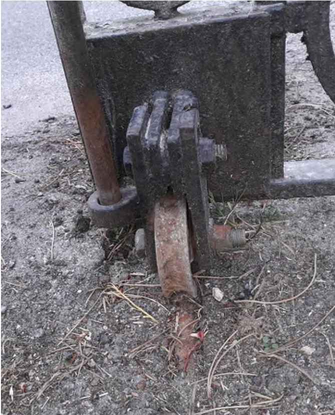
Figure 3- Gate supporting wheel (existing)