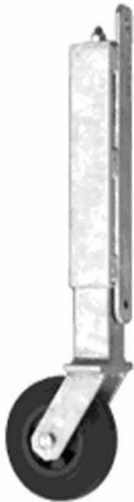
Figure 4 - Gate supporting wheel (proposed)