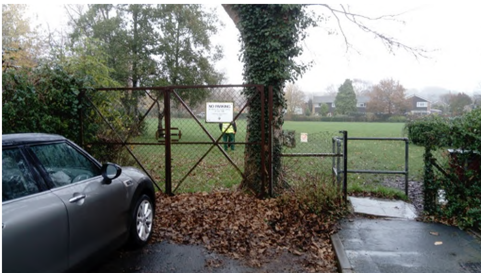
Figure 1 - Mature sycamore at North Poulner Play Area entrance

Kelvin Wentworth, Grounds Foreman Direct Dial: 07918 615200 Email: kelvin.wentworth@ringwood.gov.uk