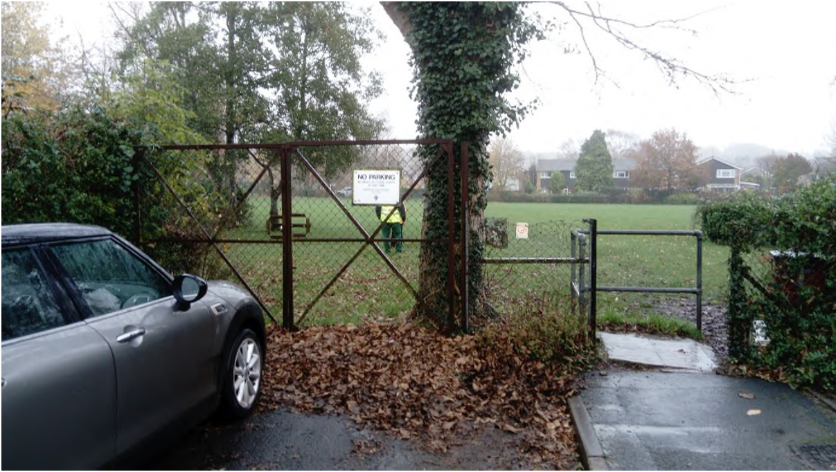
Figure 1 - Mature sycamore at North Poulner Play Area entrance