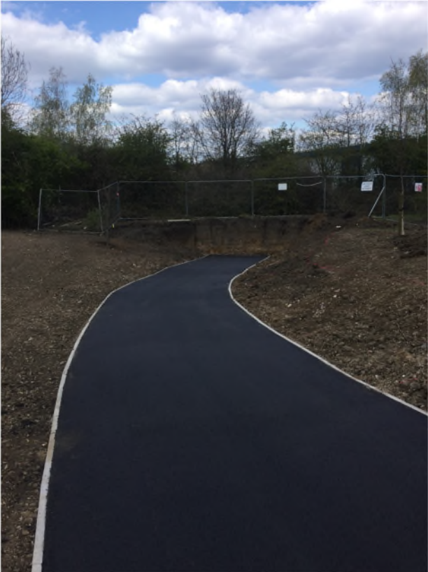
Link from Yarrow Lane constructed by Vistry