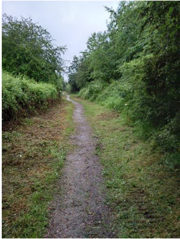
After clearance undertake on our behalf by RTC