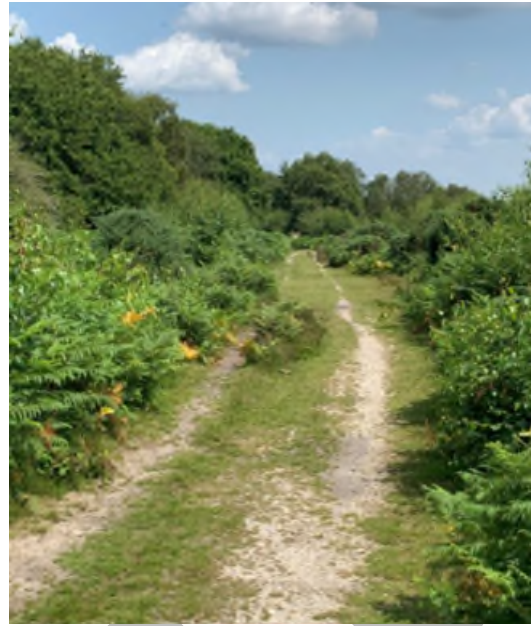
View towards Picket Post