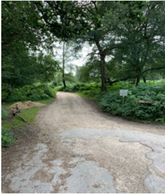
Picket Hill road