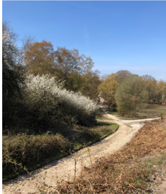
View towards Linford Bottom