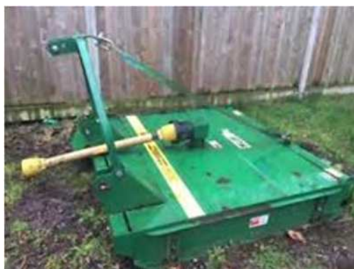
Figure 3 – Major Grass-topper: