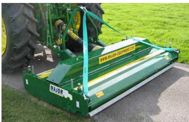
Figure 1 – Major Roller-Mower (Note – This is a Library image)