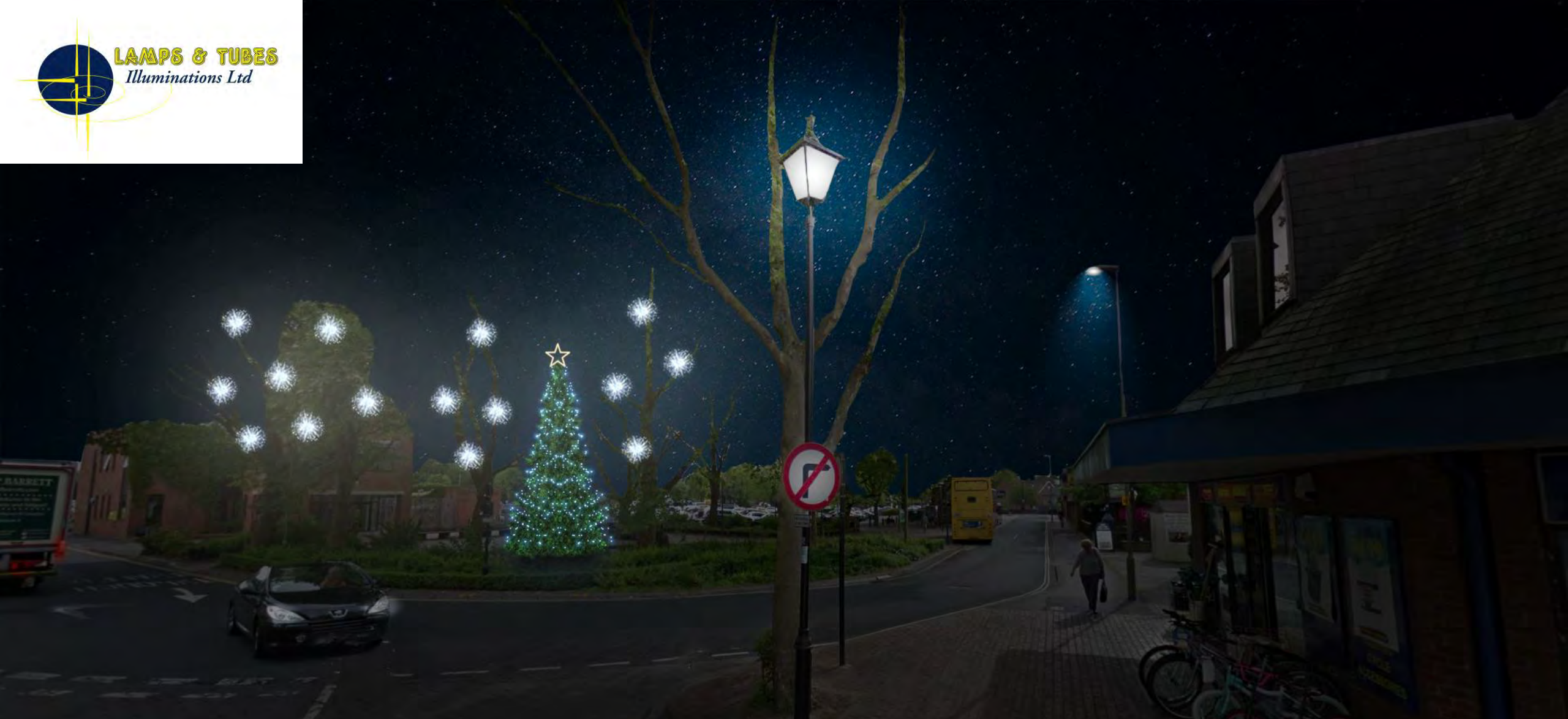
Mistletoe Stars in Cool White Christmas Tree in Blue LED Garland