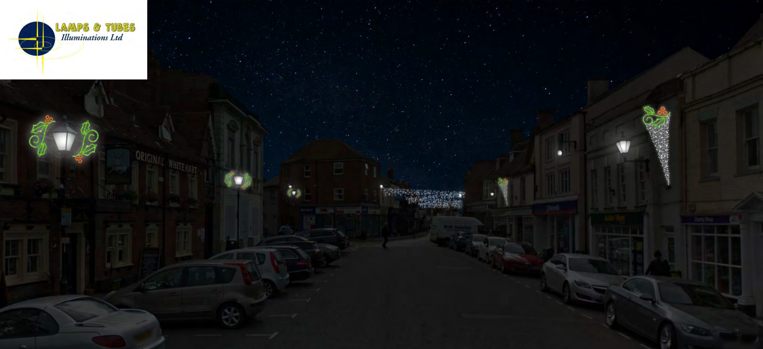
Ref. LTS.HollyWrap in Green & Red LED Rope Ref.123539 in Red & Green LED Rope, with White Mini Lights Icicles in Cool White