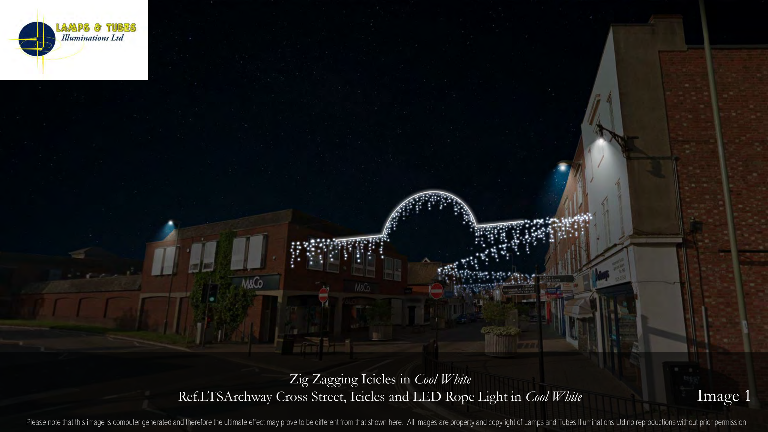
Zig Zagging Icicles in Cool White Ref.LTSArchway Cross Street, Icicles and LED Rope Light in Cool White