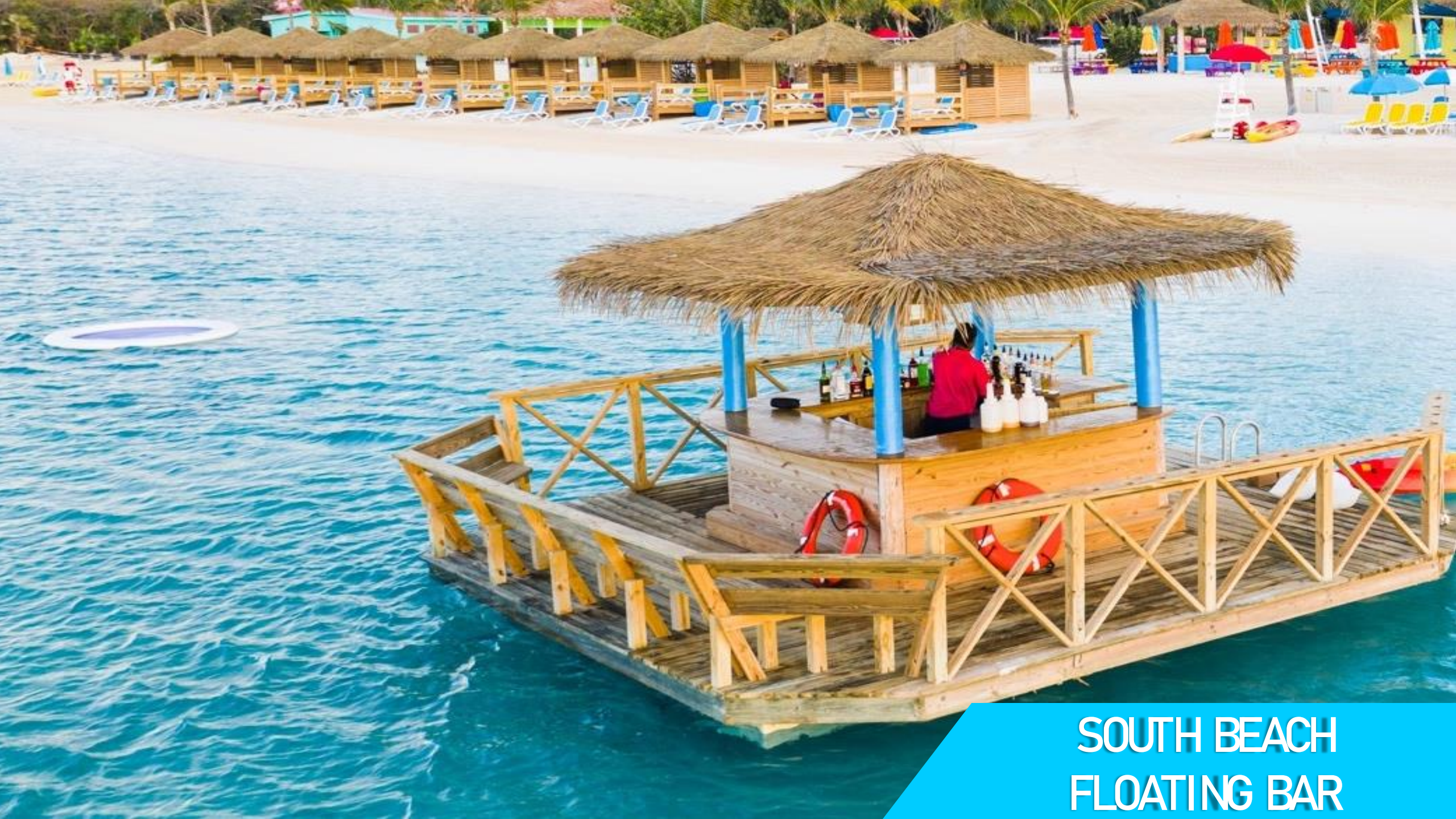
SOUTH BEACH FLOATING BAR