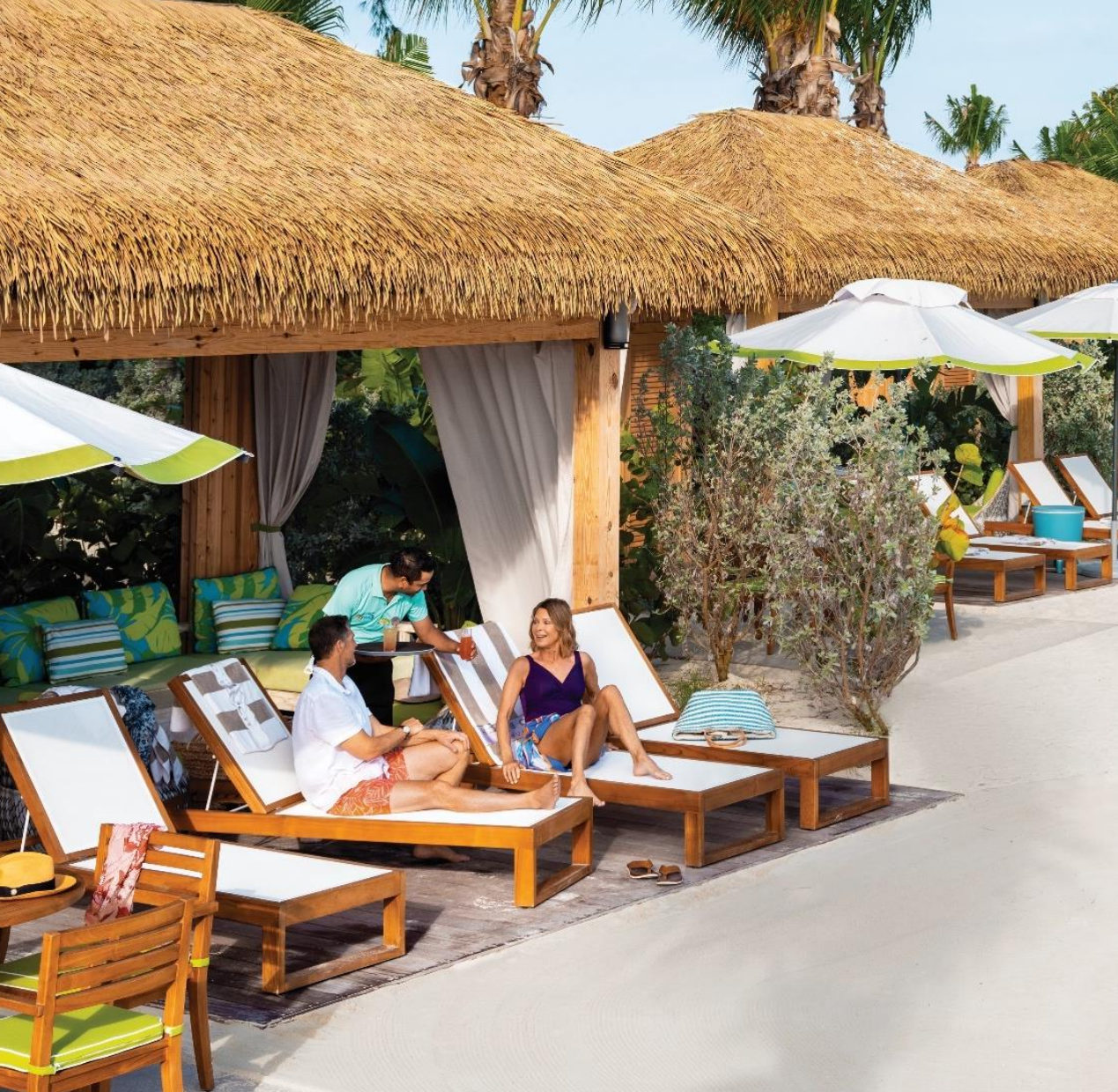
BEACH CABANAS $