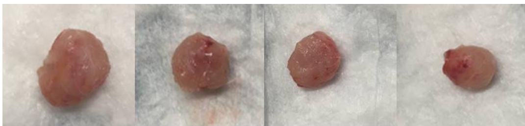
Figure SI 2. Digital images of tumor after different treatment at 7 days. From left to right side, they stand for PBS, PBS with radiation, bismuth nanoparticles without radiation, and bismuth nanoparticles with radiation, respectively.