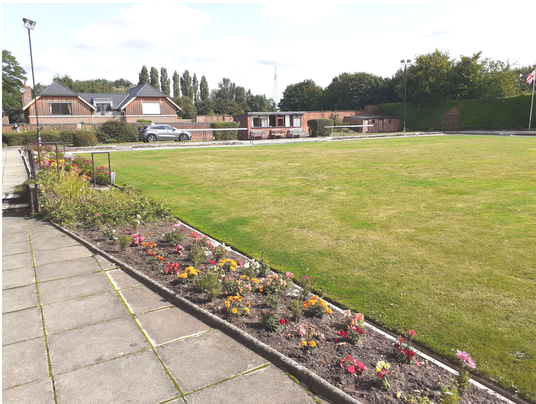
Grounds with large Grassed Area