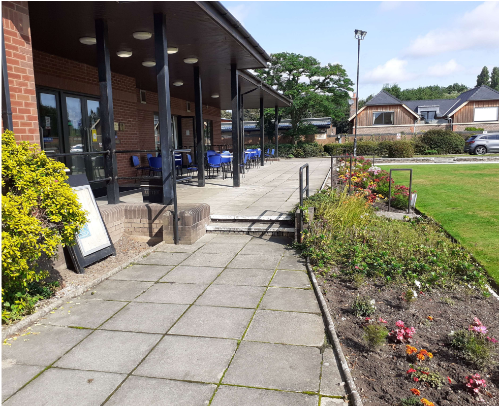
Outside Canopy Area