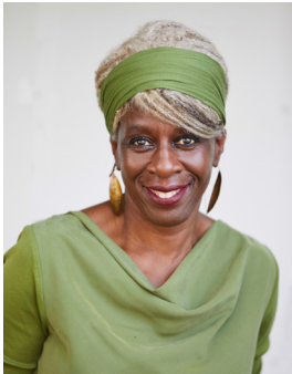
Lola Young , United Kingdom

Lola Young received an OBE in 2001, and went on to become an independent crossbench member of the House of Lords in 2004, where she is actively involved in legislation and campaigns on criminal and social justice issues such as children in state care, modern slavery and women and girls at risk. As an ambassador for Cotton Made in Africa, the Ethical Fashion Forum and MADE-BY, and a former member of the board of Aid by Trade, Lola promotes ethical, sustainable fashion and is the founding chair of the All Party Parliamentary Group on Ethics and Sustainability in Fashion. She is currently a commissioner at Historic England and has chaired the Orange Prize for Literature, the Caine Prize for African Literature, judged the Art Fund Prize, the Observer Ethical Awards, and is the 2017 chair of the Man Booker Prize judging panel. Lola was a professor of cultural studies at Middlesex University as well as a writer, cultural critic, public speaker and broadcaster. Appointed as head of culture at the Greater London Authority, she has also been a board member of the South Bank Centre, the Royal National Theatre, and The National Archives in London, UK. She holds honorary doctorates from Middlesex University, University of the Arts London, and Sussex University, UK.