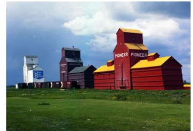
R-PS80-1272-254, Grain elevators in Grayson, SK, 1980