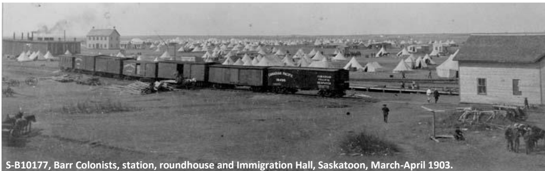
S-B10177, Barr Colonists, station, roundhouse and Immigration Hall, Saskatoon, March-April 1903.