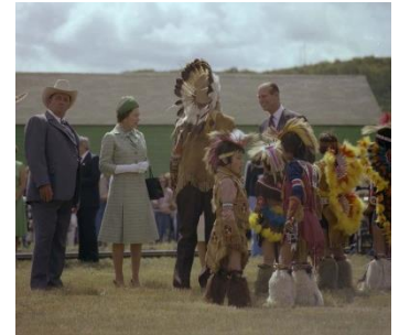
R-PS78-1030-122: Queen Elizabeth and Prince Philip's Royal Visit, 1978