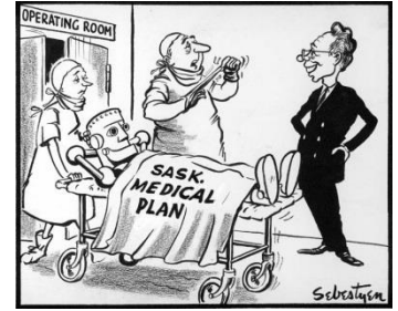
F379, Ed Sebestyen fonds, File 450: Medicare editorial cartoon.