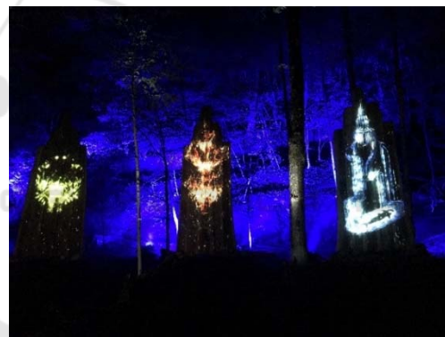
Figure 2: An image of the illuminated nocturnal trail.

The experience, which consisted of a one hour walk, occurred entirely outdoors, in a forest in North America, on a levelled dirt trail. The trail included hills of moderate slopes. Access to 1.5-km illuminated multisensory nocturnal trail (see figure 1, 2 and 3) was done via a chairlift. The trail weaves its way down the hill through the woods, crosses streams and clearings.