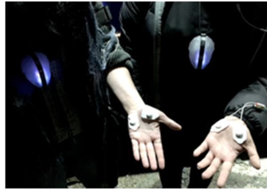
Figure 4: The amulets and physiological sensors. EDA was recorded using two electrodes placed on the palm of the non-dominant hand.

EDA measures the activity of the eccrine sweat glands and has been shown to be correlated to arousal. It can also be used to measure emotions (Boucsein, 2012) during system interactions (figure 4). Valence is used to contrast states of pleasure (e.g., happy) and displeasure (e.g., angry), and arousal to contrast states of low arousal (e.g., calm) and high arousal (e.g., surprise). The sensor enclosure box was placed on participants' left arm and secured with an exercise band. EDA was recorded with a sampling rate of 100Hz.