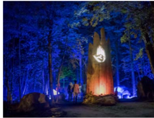
Figure 1: An image of the illuminated nocturnal trail.

The location of the data collection was selected among the installations already in operation and open to the public. This gave us the opportunity to work with an interesting physiological dataset without having to build the interactive environment ourselves, and to have access to a large and diverse population.