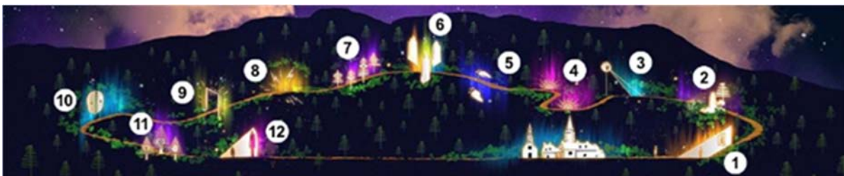
Figure 3: The figure above shows an overview of the experience. Participants were fitted at the base camp located at the base of the chairlift (zone 1). Zones 1, 4, 5, 6, 7, 10 and 11 were contemplative; zones 2, 3 and 9 were immersive; zone 8 was interactive and zone 12 was participative.

Ambient sounds and an original soundtrack also served to enhance visitors' experience. Participants