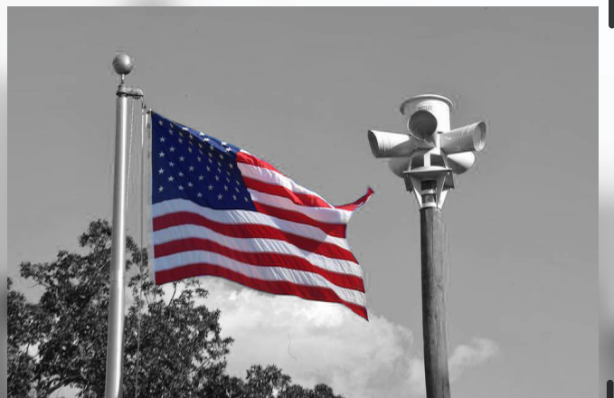
Proudly manufactured in the U.S.A.