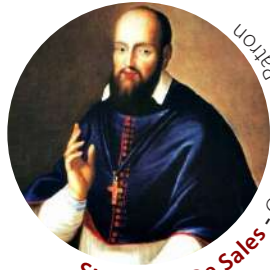
St. Francis De Sales - Our Heavenly Patron

The SFS Academy is named after St. Francis de Sales, our patron, who considered knowledge as the eighth sacrament. His patience, humility, meekness and gentleness won many hearts and so he was well –renowned as the 'Gentleman Saint' for his remarkable contribution to the literary world, in 1923, Pope Pius XI proclaimed him as a Patron of writers and journalists.