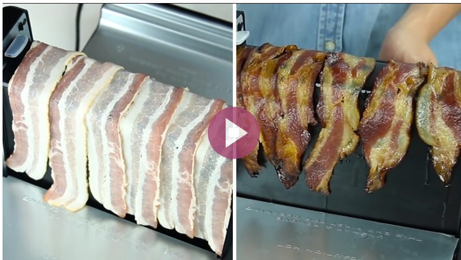
Bacon toaster cooks rashers in 2 minutes and even better - it helps cut-down on washing up