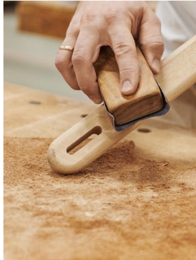
Honesty in materials