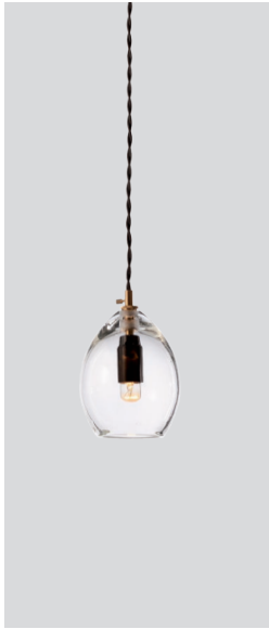
Unika small – Item no. 530