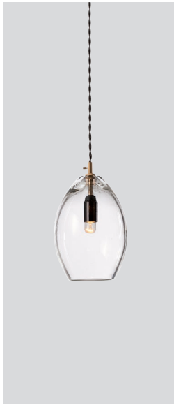
Unika large – Item no. 531