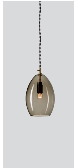
Unika large grey – Item no. 536