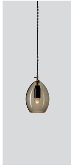
Unika small grey – Item no. 535