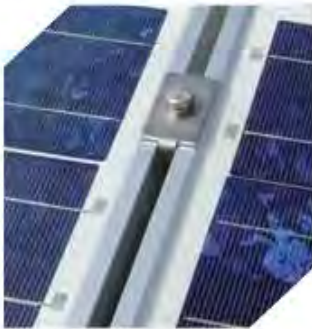
Tight inter-module spacing for higher density