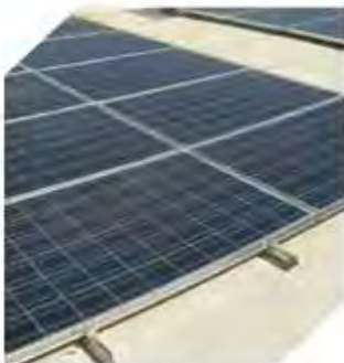
Configurable around roof obstructions

Our engineering staff is available to assist with your next project. Please provide module type, design wind speed, exposure category and building roof layout and height information.