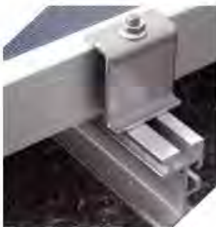
Fast Top-Down clamping