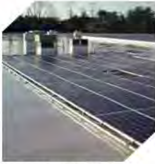
Increased module density