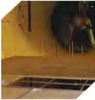
Full Scale Wind Tunnel Tested and Qualified