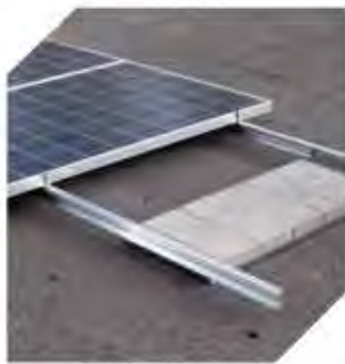
Ballasted – No penetrations