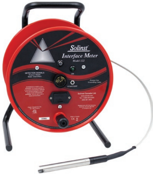
Oil/Water Interface Meter