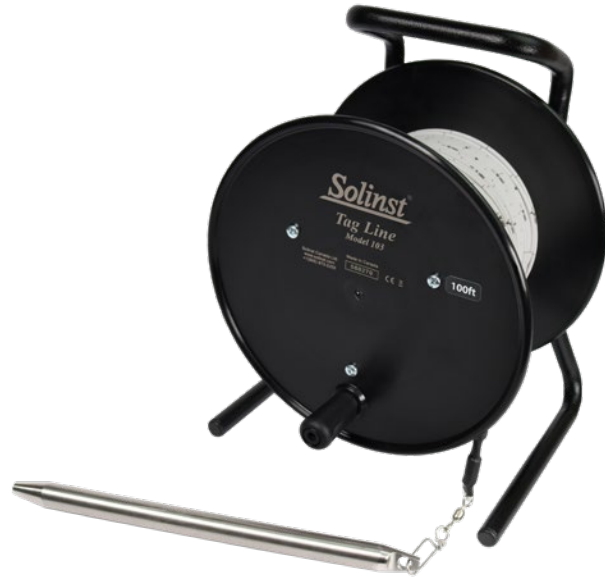
Tag Line / Suspension Cable