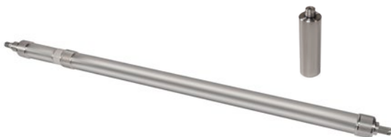
425-D Deep Sampling Discrete Interval Sampler and Weight