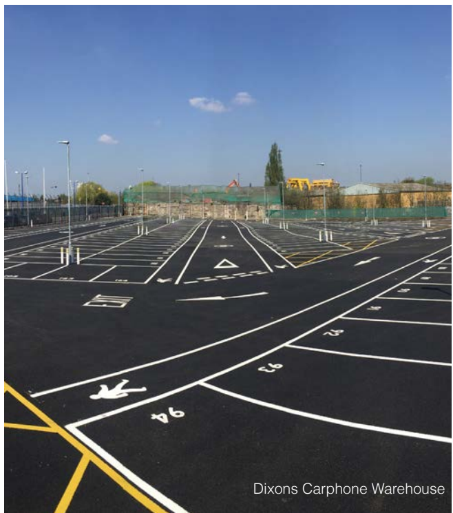
Dixons Carphone Warehouse