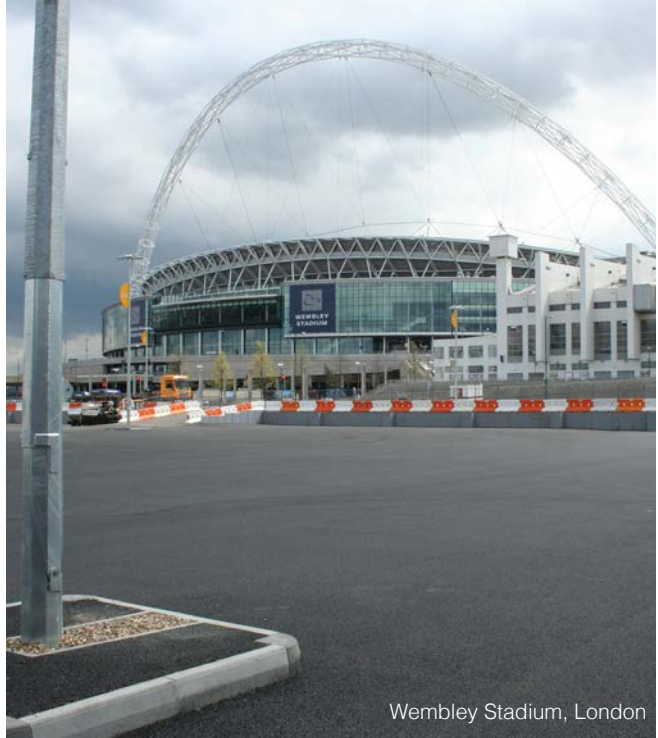
Wembley Stadium, London