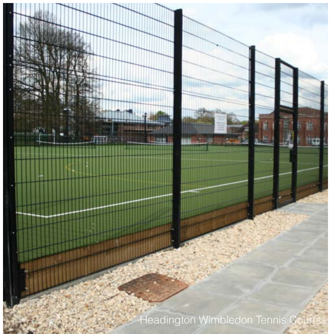
Headington Wimbledon Tennis Courts