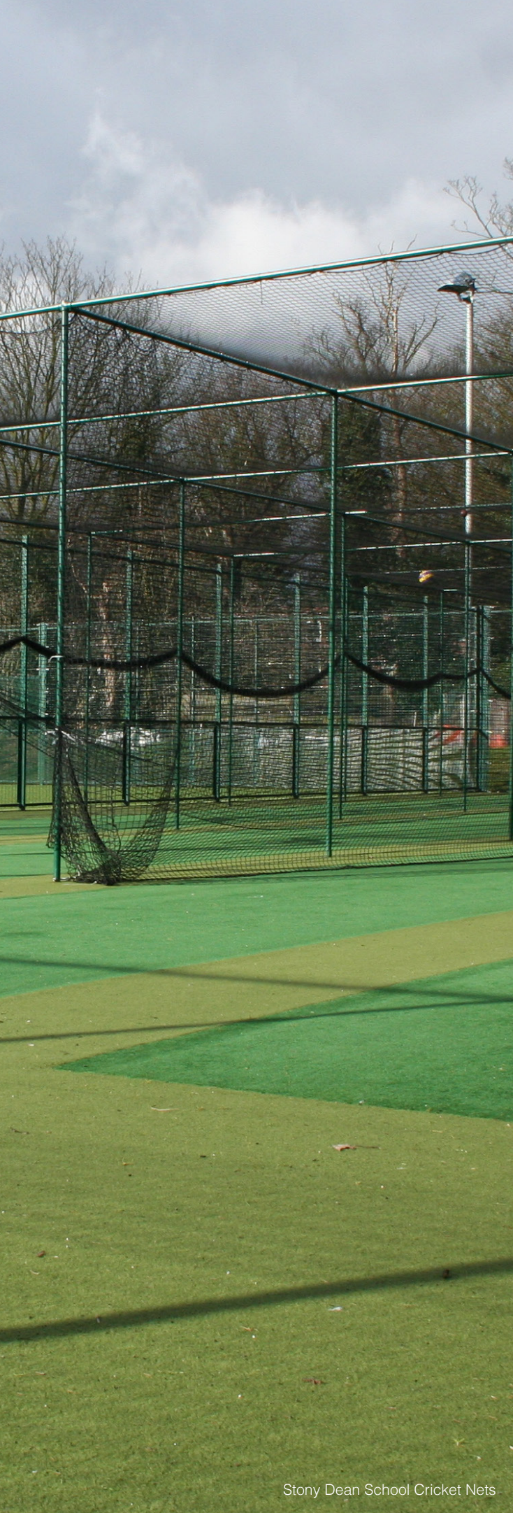
Stony Dean School Cricket Nets