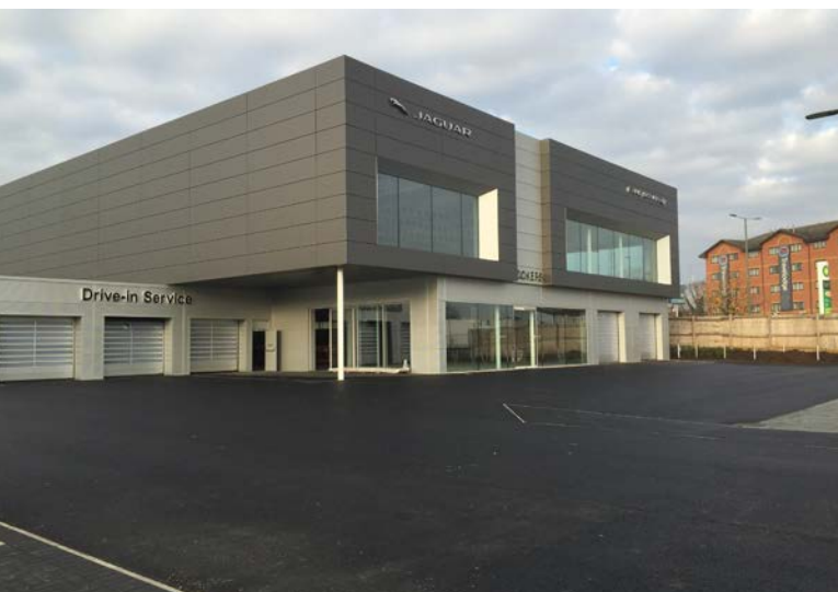
SURFACING Page 8