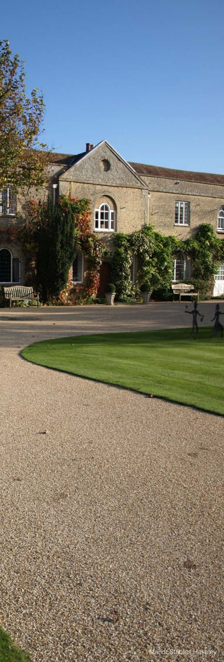
Manor Stables Haseley