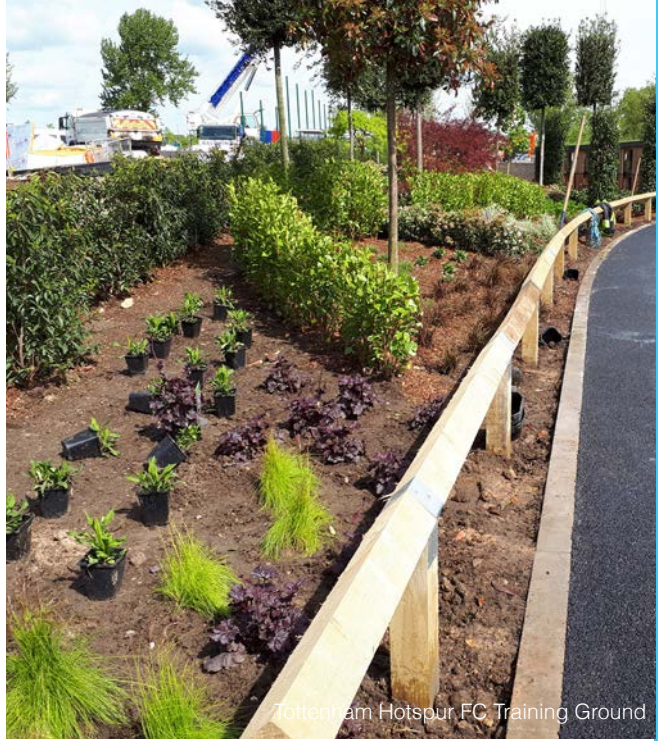
Tottenham Hotspur FC Training Ground