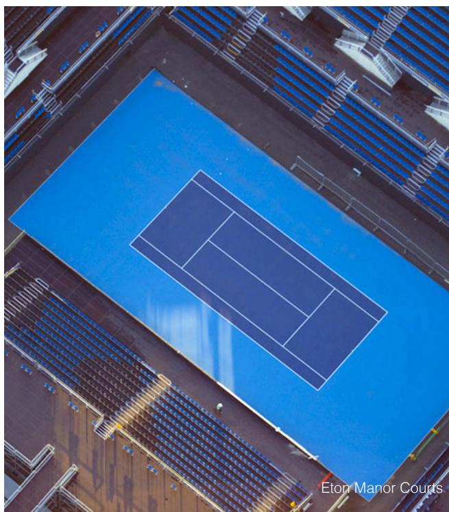
Eton Manor Courts