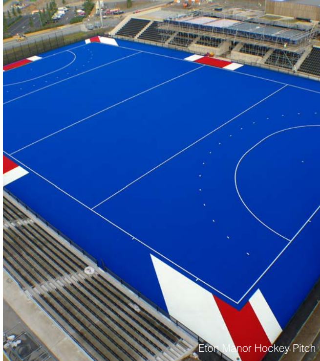
Eton Manor Hockey Pitch