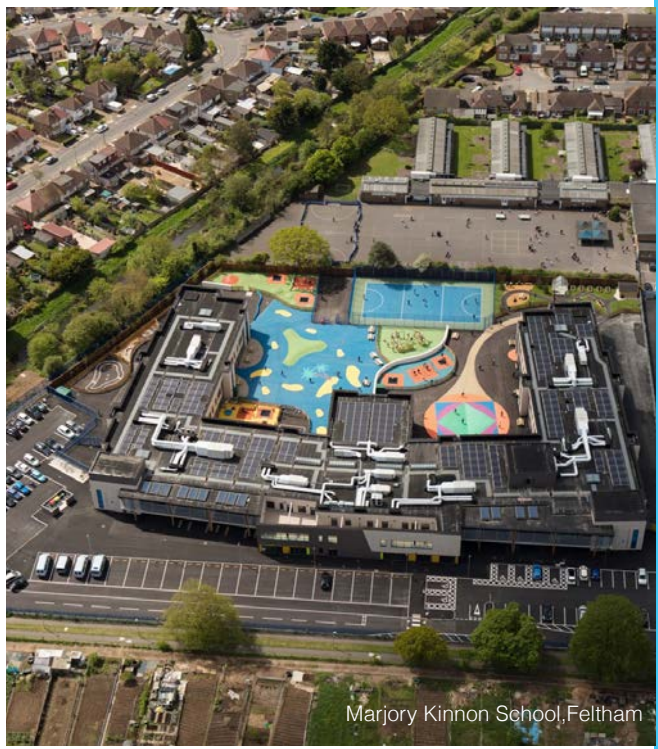
Marjory Kinnon School, Feltham