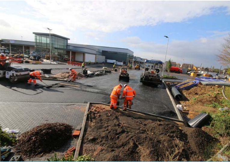
CIVILS Page 4