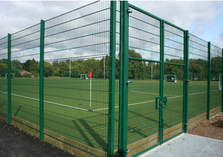
SPORTS Page 6