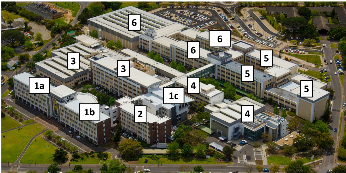
Figure 1.1: The building complex of the Faculty of Engineering (the numbers are used in the descriptions below).

The current building complex in Banghoek Road, Stellenbosch, was completed in the seventies and since then it has been expanded from time to time; for example, when the Knowledge Centre was added in 2012. The figure below shows an aerial photograph of the building complex.