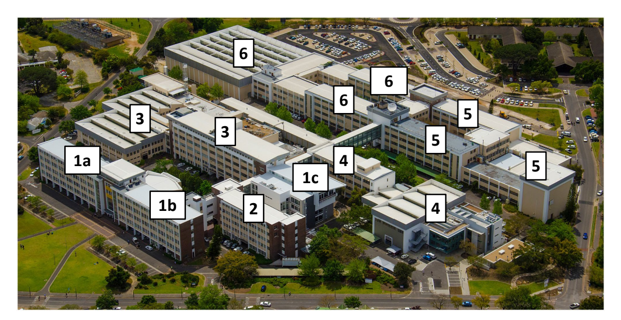
Figure 1.1: The building complex of the Faculty of Engineering (the numbers are used in the descriptions below).

The current building complex in Banghoek Road, Stellenbosch, was completed in the seventies and since then it has been expanded from time to time; for example, when the Knowledge Centre was added in 2012. The figure below shows an aerial photograph of the building complex.