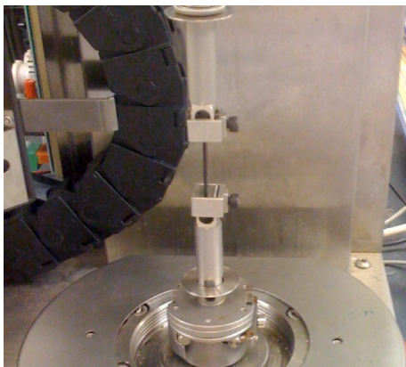
Figure 1. The Rectangular torsion fixture of the ARES rheometer used to measure the \beta -relaxation of PEMA/graphene oxide

To study the \beta -relaxation of PEMA/graphene oxide, dynamic temperature ramps were run from -40 to 60 °C at 1\text{ Hz} ( 2\pi rad/s) frequency, 0.02 % strain and a heating rate of 1^\circ\text{C} / \text{min} , in auto-tension mode. The sample was prepared as described previously 11 and molded through compression molding using a hot-press at 473 K for 5 mins.