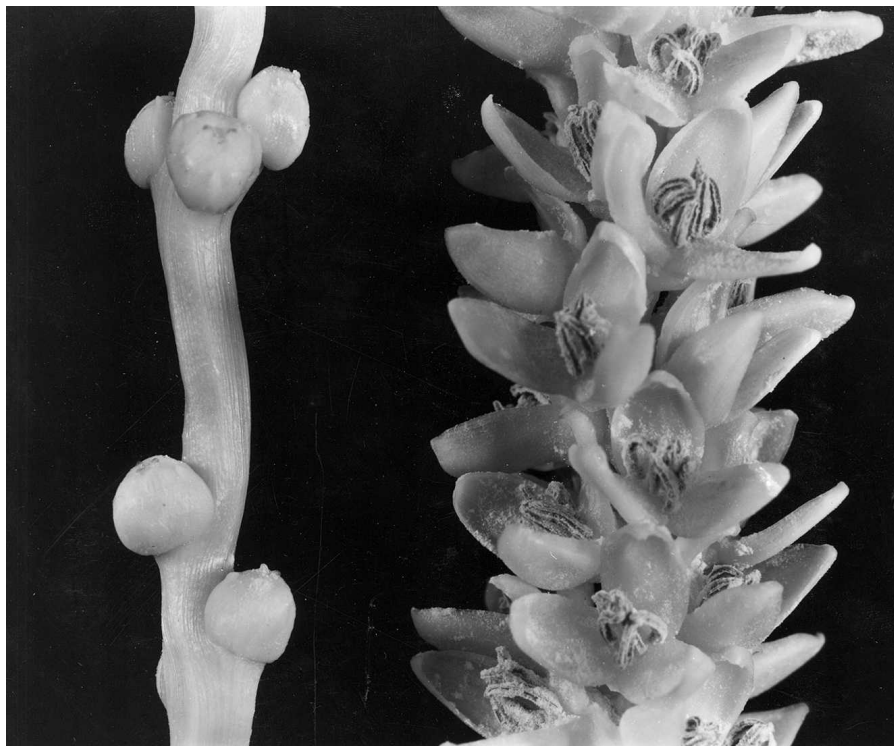
Fig. 2. Male (left) and female (right) flowers of date palm.

belonging to Palmaceae (Barrow, 1998). The name of date palm originates from its fruit; “phoenix” from the Greek means purple or red (fruit), and “dactylifera” refers to the finger-like appearance of the fruit bunch. Date palm is dioecious, meaning it has separate female and male trees. Throughout the years, there have been various reports of hermaphroditic trees developing, or male trees developing female characteristics (Sudhansu and Abo El-Neil, 1999). Inflorescences of female and male trees differ in morphology (Nixon and Carpenter, 1978; Swingle, 1904; Vandercook et al., 1980). Both are enclosed in a hard, fibrous cover (the spathe) that protects the flowers from heat and sunlight during the early stage of flower development.