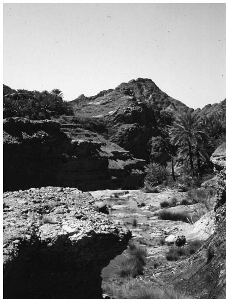
Fig. 1. The Khattwa Oasis in Oman is representative of the types of conditions in which date palms originated and are adapted. Traditional date palm cultivation is still practiced in such oases. (R.R. Krueger)