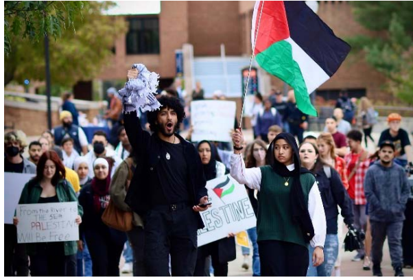
SJP demonstration at Kent State University, Ohio