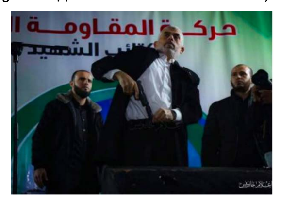
Yahya al-Sinwar with a gun taken from an IDF military patrol operation on November 11, 2018, which was revealed by Hamas. The photograph appears on website without copyright (since it was taken from Hamas' combat information, which appears in the lower right corner of the picture) compared to other websites where "Ashraf Abu Amra for APA" appears (Sama News website, November 11, 2018)