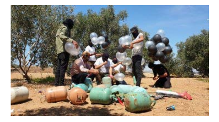
Ahfad al-Nasser terrorist operatives launch incendiary balloons at the Israeli towns and villages surrounding the Gaza Strip