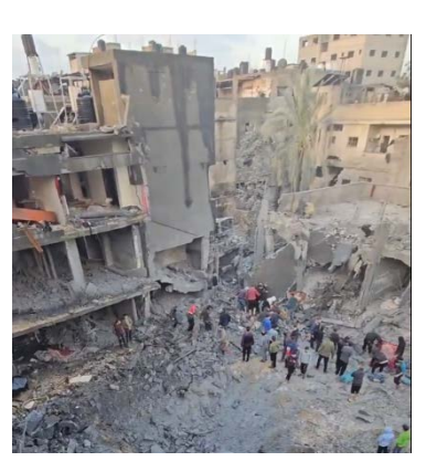
Right: A residential area in Jabaliya attacked by the Israeli Air Force at night (QudsN X account, December 14, 2023). Left: Evacuating casualties from Jabaliya (QudsN X account, December 14, 2023)