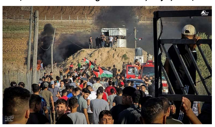
One of Anas al-Sharif's photos of the protests in East Jabalia as part of the return marches (Anas al-Sharif's Facebook page, September 22, 2023)