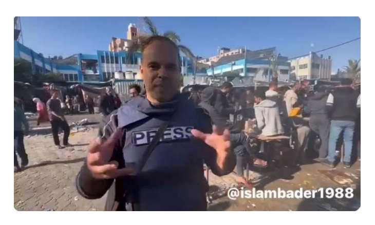
Residents at the market in the center of the Jabalia refugee camp (QudsN X account, December 15, 2023)