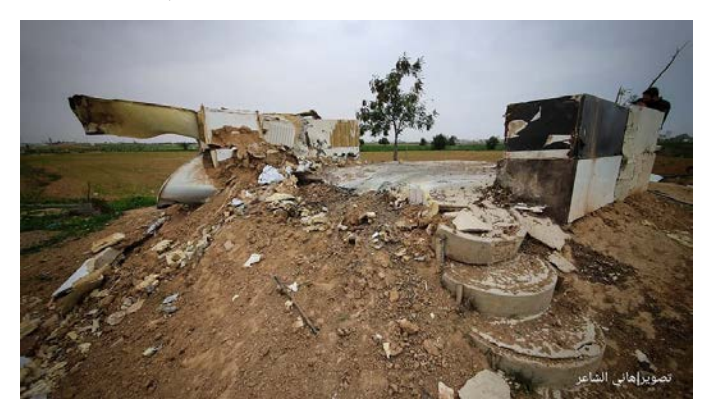
Results of the attack on the positions of Hamas' restraint force in eastern Abasan al-Jadeeda