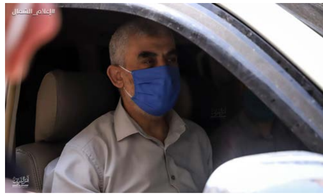
Yahya al-Sinwar visits the northern Gaza Strip