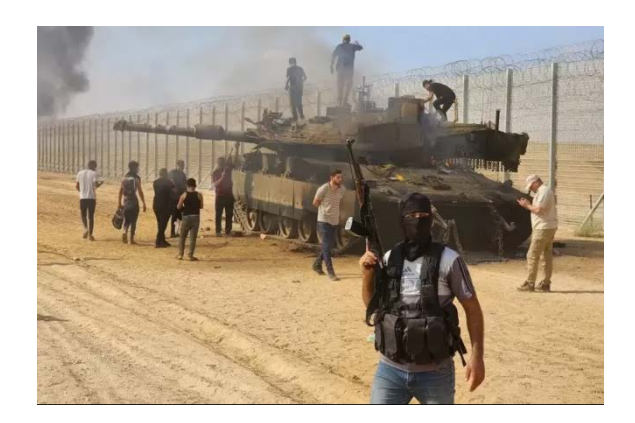
Photographs by Hani al-Shaer of the Hamas October 7 attack and massacre for al-Anadolu News (Middle East Monitor, October 10 and 12, 2023)