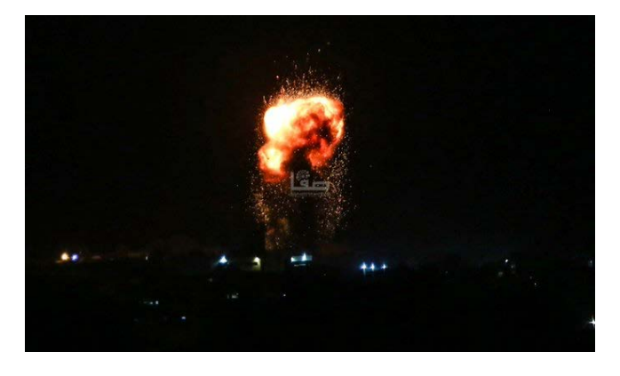
Photo by Hani al-Shaer of an explosion following an attack in Rafah for Safa (Safa Twitter account, August 3, 2020)