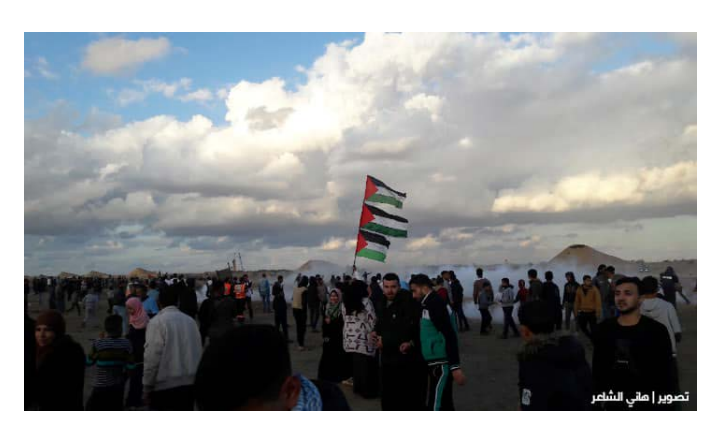
Covering a "march of return" in eastern Khan Yunis