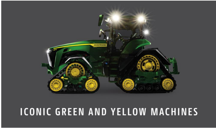
ICONIC GREEN AND YELLOW MACHINES