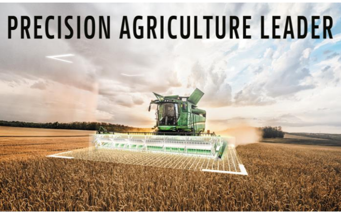
PRECISION AGRICULTURE LEADER