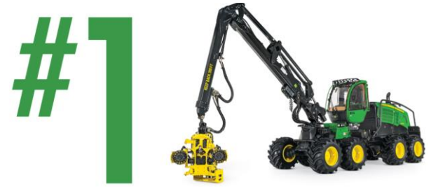
NUMBER ONE GLOBALLY IN FORESTRY