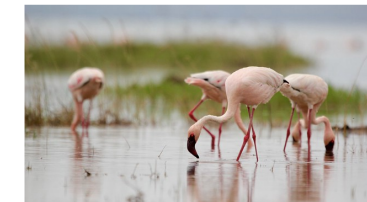
Pink flamingos at Lake Nakuru, Kenya