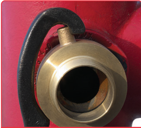
INTERNAL CORE WORKS ON PIN-TYPE HOSE COUPLINGS OR HYDRANT ADAPTERS.