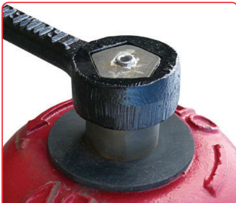
GRIPS AND RETAINS PENTAGON OR SQUARE OPERATING NUTS.