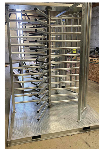
Portable Turnstile Base Plates with Full Height Single Turnstiles and ADA Gates