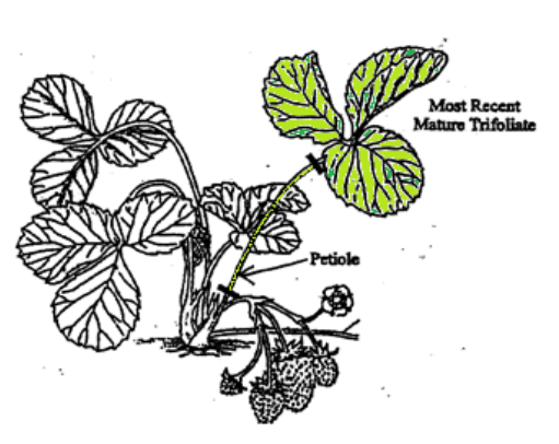
Figure 1. The proper plant parts, petiole and most recently mature trifoliate, should be sampled for