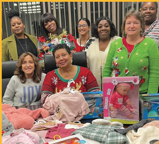
New WOS members of Local 12160 accepting gifts from our generous staff representative to assist children that lost their father in a car accident in October.