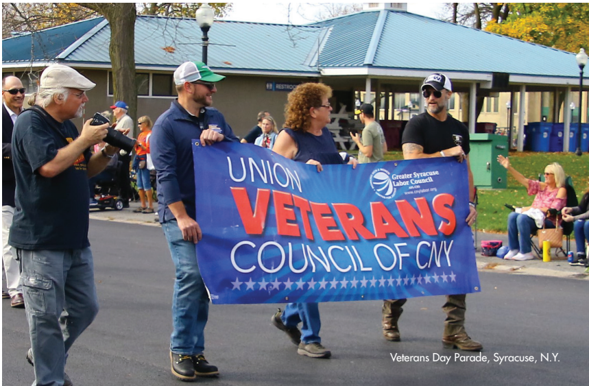
Veterans Day Parade, Syracuse, N.Y.