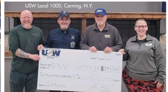
USW Local 1000, Corning, N.Y.