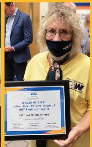
The WNY Regional Council was honored by the United Way Of Buffalo and Erie County, receiving the 2021 Champions of Labor Award.