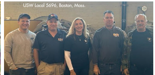
USW Local 5696, Boston, Mass.