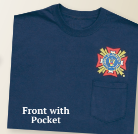
Front with Pocket