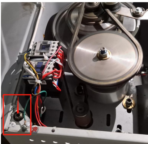
*Overload Protection Switch