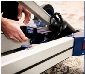
1. Battery Powered