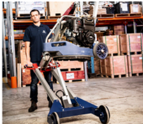
2. Solo Lift to 140KG