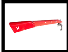
4. Nose Extension