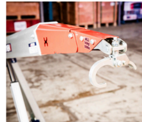
4. Auto Closing Hook