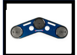
6. Glass Sucker