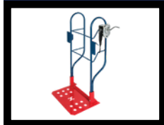
2. Strap Frame