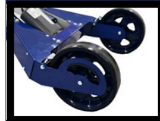
5. Big Wheels