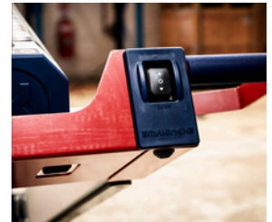
5. Switch Operated Height Adjustment