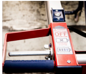
3. Hand Brake and Button Start