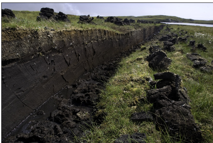
In Scotland, in the islands, peat is still widely use as domestic fuel, such as here, on the Isle of Lewis.

In other terms, in wetlands or peatlands called also bogs, moors or mire in some countries, peat is the result of the decomposition of vegetal matter, composed mainly of Sphagnum. Sphagnum is the genus of bryophyte (“mosses”) plant division and contains a few hundred species. It is a small plant of around 1-2 cm height with the main stem reaching 5-10 cm (reproductive organ) growing in very humid and wetlands. The content of water in the plant is very high, up to 70%. Under a microscope, you can see the chlorophyll floating in water. Because Sphagnum is growing in wetlands, its decomposition do occur in absence of oxygen (anaerobic decomposition) and thus, the carbon trapped in the vegetal substance cannot be release as carbon dioxide (CO 2 ). The resulting product of this decomposition, the peat is black because of its rich carbon content.