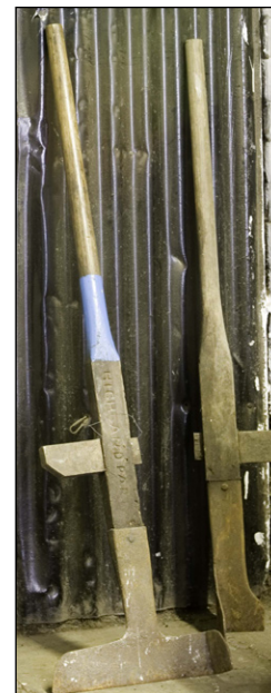
A tusker at Highland Park distillery.

Distilleries prefer to use the upper part of the cut peat, because the top layers are richer and more rooty. The upper peat layer generates more smoke and is ideal for flavouring the barley. For domestic use, the lower part is preferred; since it will burn better, generate more heat and less smoke. Also, depending on the vegetation on the moorlands, the peat might have a different structure and composition, thus the peat coming from different locations might contribute to specific flavours. During the 1990s, Highland Distillery stopped using his malting floor and using only barley prepared by a maltser. It resulted in a change of the aromatic profile of the whisky and floor malting was repeated. At the beginning of this millennium, Laphroaig has distilled a spirit made exclusively on its malting floor. The result of this experiment will be delivered in a few years. The distilleries of Glendronach and Benriach have stopped using their malting floors in the end of the 1990s. Although floor malting is uneconomical, BenRiach will restart the floor malting operations in 2008/2009. Hopefully, Glendronach will restart again. At Highland park, they tried for a short period to buy only “commercially prepared malt” but this affected the quality of the spirit. Highland park is producing about 15% of all their barley on their malting floor. In the Speyside, one distillery is still keeping their floor malting for commercial reasons (as selling point).