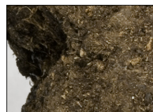
Macroscopic detail of a peat clump used in scot-tish distilleries.

Peat is abundant in the Northern countries (e.g., Russia, Canada, Scandinavia and United Kingdom (including Scotland) and in order to be used as fuel, it must be dried. In Scotland, peat was traditionally manually cut with spades. A flughter spade is traditionally used to cut and remove the leaving mossy part, and then bands of peat are cut using a rutter and finally a tusker is used to cut the peat blocks. Once cut, the peat is stacked to form a peat stack, also called storrows, and left to dry. The upper part of the peat is then put back on top of the peat field in order to minimize