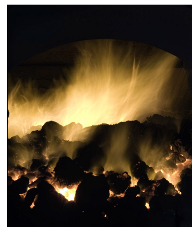
A peat fire inside a kiln to dry the barley and to give a smoky flavour to the spirit.

Distilleries prefer to use the upper part of the cut peat, because the top layers are richer and more rooty. The upper peat layer generates more smoke and is ideal for flavouring the barley. For domestic use, the lower part is preferred; since it will burn better, generate more heat and less smoke. Also, depending on the vegetation on the moorlands, the peat might have a different structure and composition, thus the peat coming from different locations might contribute to specific flavours. During the 1990s, Highland Distillery stopped using his malting floor and using only barley prepared by a maltser. It resulted in a change of the aromatic profile of the whisky and floor malting was repeated. At the beginning of this millennium, Laphroaig has distilled a spirit made exclusively on its malting floor. The result of this experiment will be delivered in a few years. The distilleries of Glendronach and Benriach have stopped using their malting floors in the end of the 1990s. Although floor malting is uneconomical, BenRiach will restart the floor malting operations in 2008/2009. Hopefully, Glendronach will restart again. At Highland park, they tried for a short period to buy only “commercially prepared malt” but this affected the quality of the spirit. Highland park is producing about 15% of all their barley on their malting floor. In the Speyside, one distillery is still keeping their floor malting for commercial reasons (as selling point).